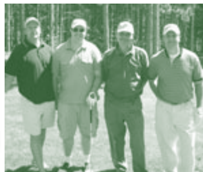
Dennis, Gartland & Niergarth Team