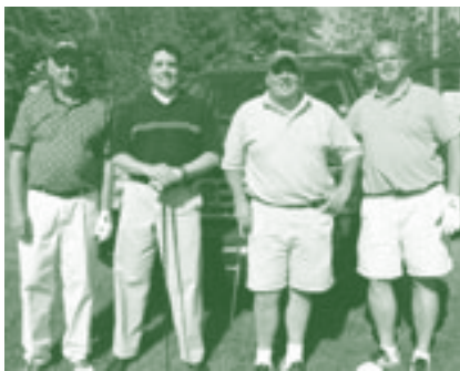
DTE Energy Team

Congratulations to the two teams that tied to win CRA's first Greens Fore Streams golf event. Thank you to our title sponsor, Scientific Anglers-3M, our host, Crystal Mountain, and everyone that sponsored, donated, and participated in this great day of fun to benefit northern Michigan's natural resources!