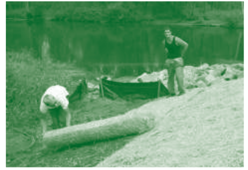
Subcontractors roll out straw mulch matting to help revegetate the embankments at Indian Bridge.