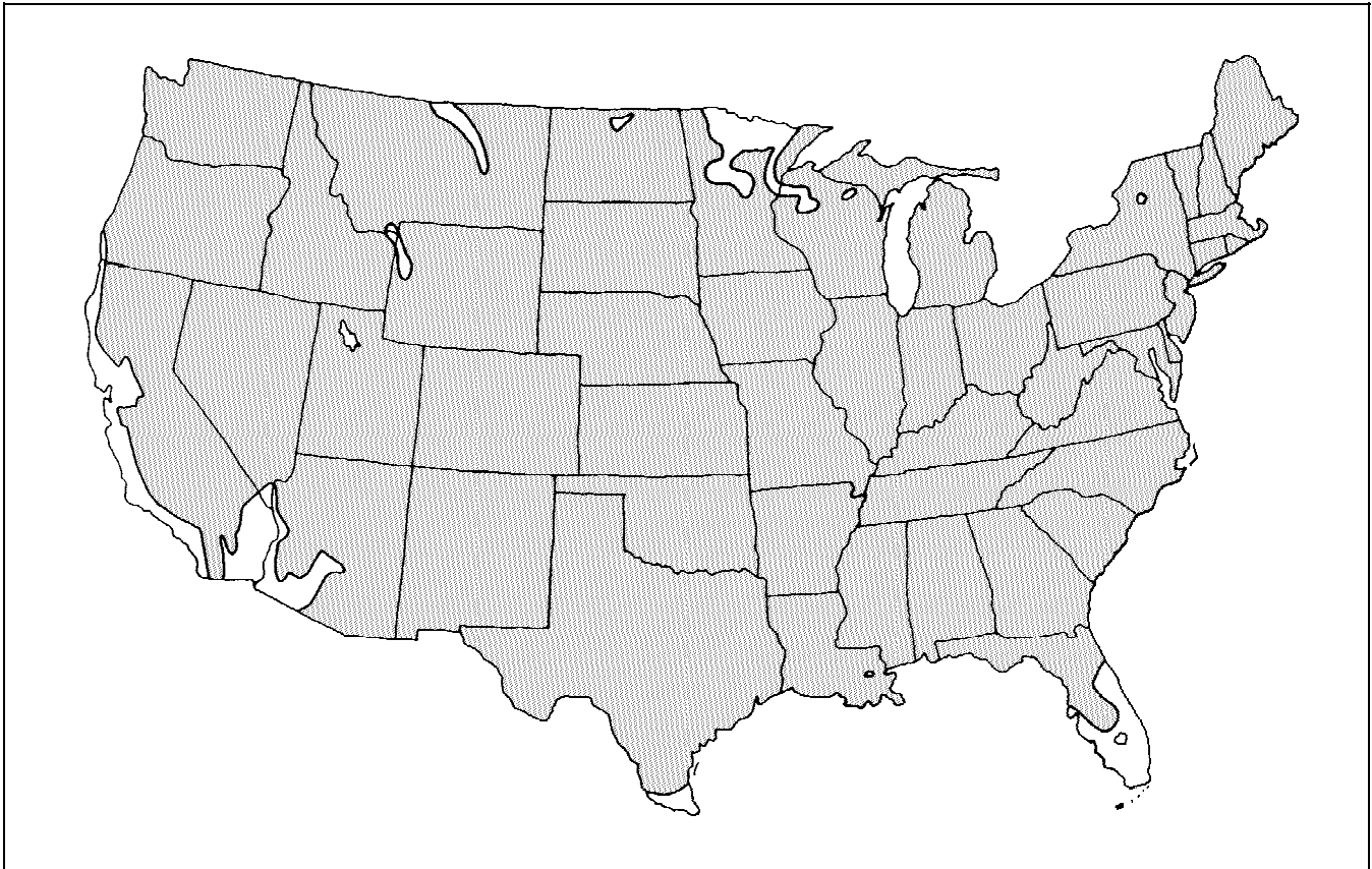
Figure 2. Shaded area represents potential planting range.